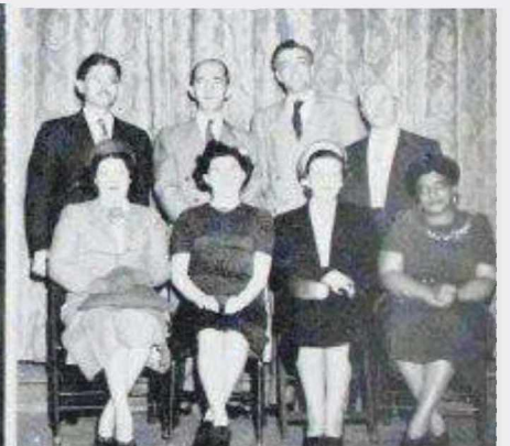
Year Book Committee